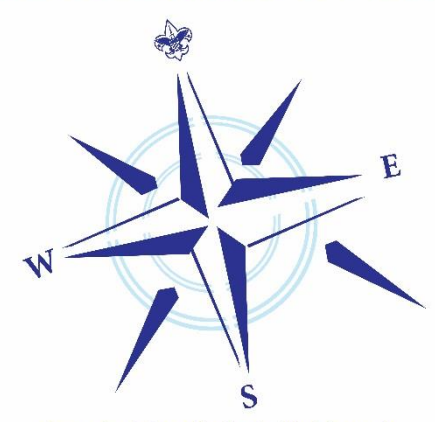
GREATER ST. LOUIS AREA COUNCIL, BOY SCOUTS OF AMERICA