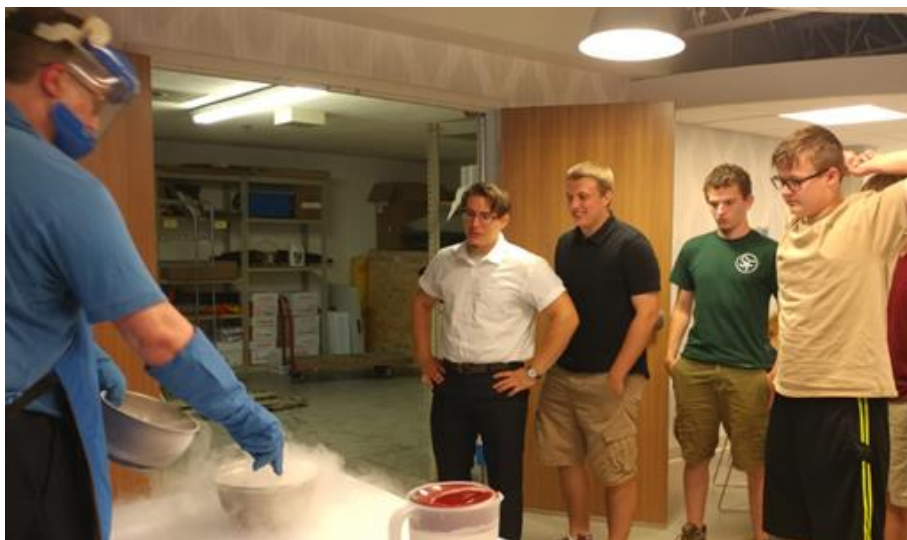
Liquid Nitrogen Ice Cream