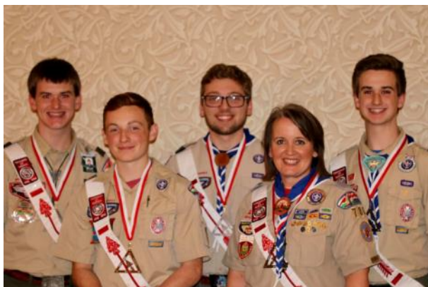
2018 Vigil Honorees