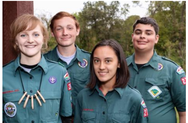
2018/2019 Gravois Trail VOA

STL Adventure Scavenger Hunt February 23, 2019 8AM-3PM