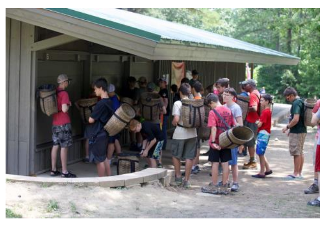
Summery camp fun

The Fall Pacao will be October 11-13 at Beaumont Scout Reservation. The Scouts BSA Theme is "Back to the Future" and the Camp Master is Kyle Kannawurf. The Scouts BSA Manual will be posted