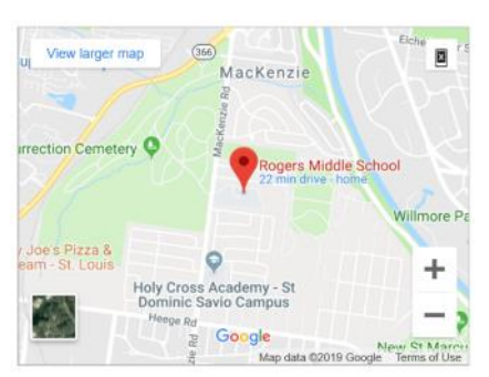
Click map to link to larger map

REMINDER: Roundtable will be held at Rogers Middle School: