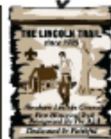
Commemorative Patch Black Border

2015 marked the 90 th anniversary of the Lincoln Trail. This commemorative patch may be pre-ordered for $5 each. In addition, special editions are available for purchase recognizing "milestones" of 5+, 10+ or 15+ times hiking the trail. The commemorative patch has a black border, the others are bronze, gold and silver, like Eagle Scout palms. $5.00 each