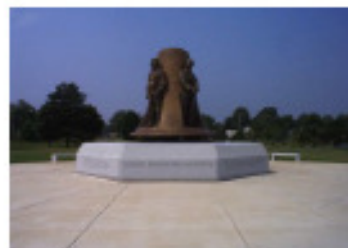
Korean War Memorial