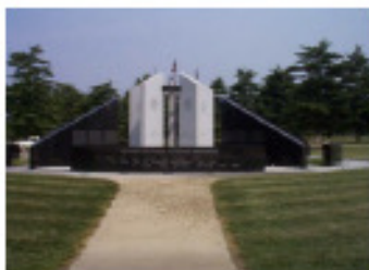
Vietnam War Memorial