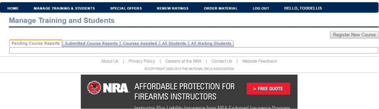
Figure 1. How to register a new NRA course at <a href="www.nrainstructors.org">www.nrainstructors.org</a>. Instructors must first log in using their user name and password.