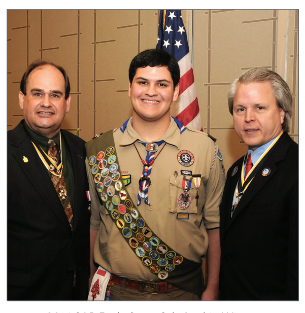
2014 SAR Eagle Scout Scholarship Winner