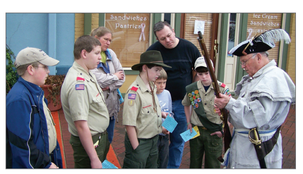
Scouts observing musket demonstration during Washington, Georgia, ceremonies.

The SAR and the Boy Scouts participate in many activities together. Scouts of all ages can help during SAR parades and ceremonies including grave markings and Revolutionary War battle ceremonies. SAR members contribute to Scouting activities by teaching relevant merit badges, such as American Heritage, Genealogy, Law, Citizenship in the Community, Citizenship in the Nation, and Citizenship in the World.