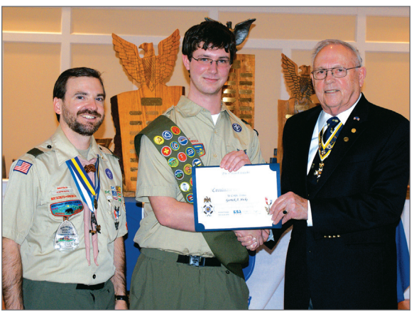
Eagle Scout Court of Honor recognition by the Sons of the American Revolution.

The SAR and the Boy Scouts participate in many activities together. Scouts of all ages can help during SAR parades and ceremonies including grave markings and Revolutionary War battle ceremonies. SAR members contribute to Scouting activities by teaching relevant merit badges, such as American Heritage, Genealogy, Law, Citizenship in the Community, Citizenship in the Nation, and Citizenship in the World.