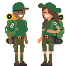
Venturing Ages 14-21