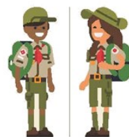
Scouts BSA Ages 11-17