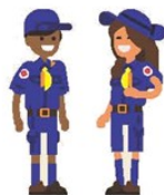
Cub Scouts Ages 5-10